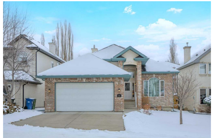
261 Tuscany Ridge Park NW, Calgary, AB

Welcome to this beautiful bungalow ideally located in the heart of Tuscany, on a quiet cul-de-sac just steps away from schools and shopping and the Tuscany Club, along with the extensive network of walking paths and greenspace that are such an integral part of this community. With 10 ft ceilings throughout the 1,670 square foot main level, youâ€™ll appreciate the feeling of space you get when you walk through the front door, and youâ€™ll quickly sense the pride the owners of this immaculate home have taken in caring for it. The main floor underwent a major update in 2022, which included repainting all of the walls, retiling of the baths and showers in the ensuite and main bathrooms, and new countertops and appliances in the kitchen (Bosch refrigerator, Miele dishwasher, and Samsung induction stove with split oven). Carpets in the living room, primary bedroom, second bedroom and den were also replaced, while the original hardwood floors throughout the rest of the main living area are in excellent condition. Triple-glazed windows throughout the main level and new exterior doors were installed in 2019, as were new furnaces, hot water tank and air conditioning, keeping the home comfortable through all seasons. The lower level features a large rec room with wet bar and built-in speakers, three good-sized bedrooms (windows donâ€™t meet current egress requirements), and a three-piece bathroom with fully tiled shower, plus a huge utility room with plenty of storage or further